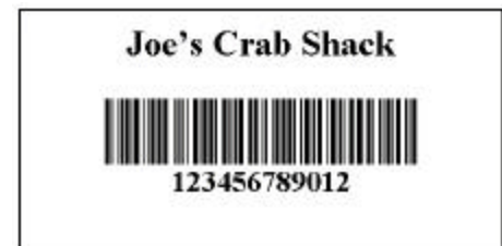
Figure 3.1 Sample Label